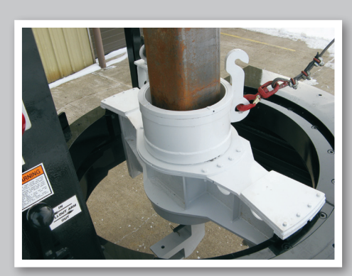
51" heavy duty turntable