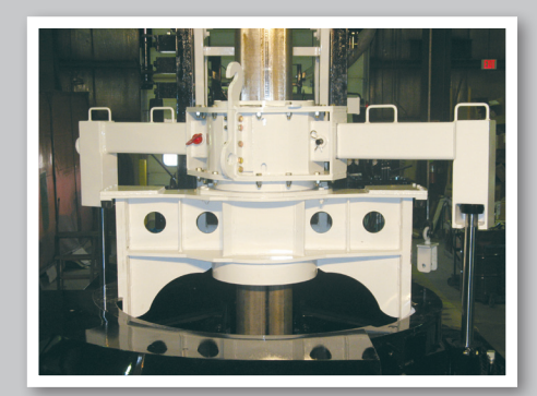
Pull down assembly